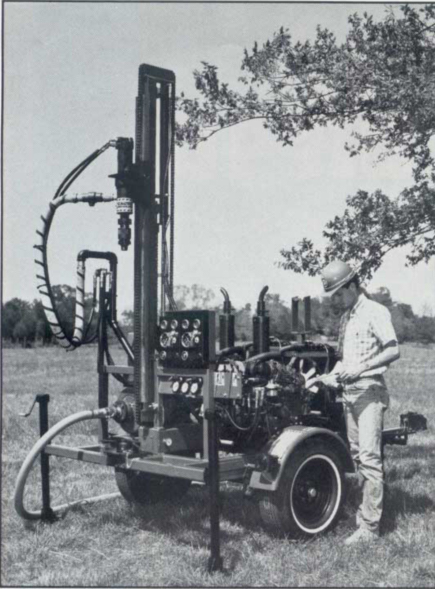
DR 40 with 18 hp Perkins diesel (water cooled)